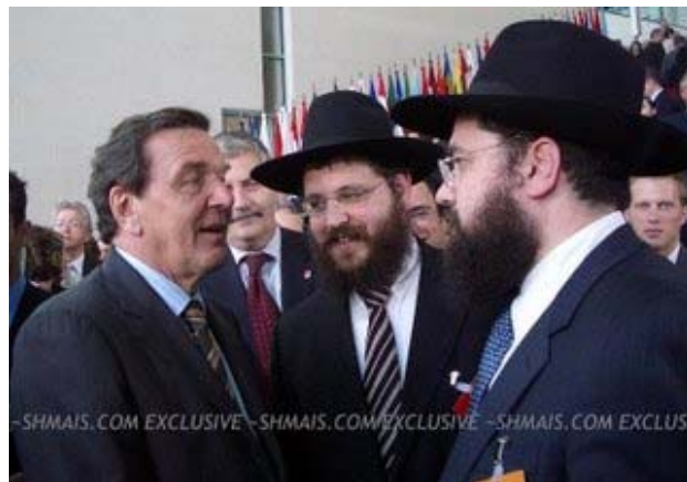
Germany - Chancellor Gerhard Schroeder